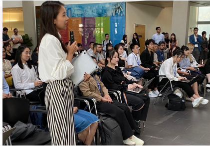
NUS student was keen to explore career opportunities in HK.